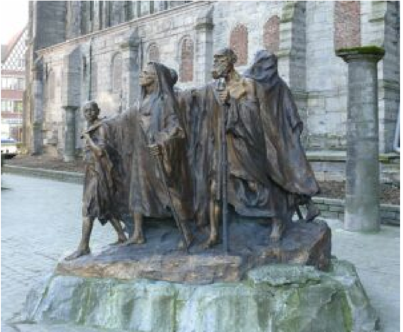
„Les Aveugles” – Guillaume Charlier

3. You have a rather classical art training, which, to my mind, is necessary no matter what direction one chooses later on. Do you think this is the case or can you be a true artist without having solid knowledge of, say, anatomical drawing? Also, what do you think the golden ratio is between technique and spirit in a piece of art?